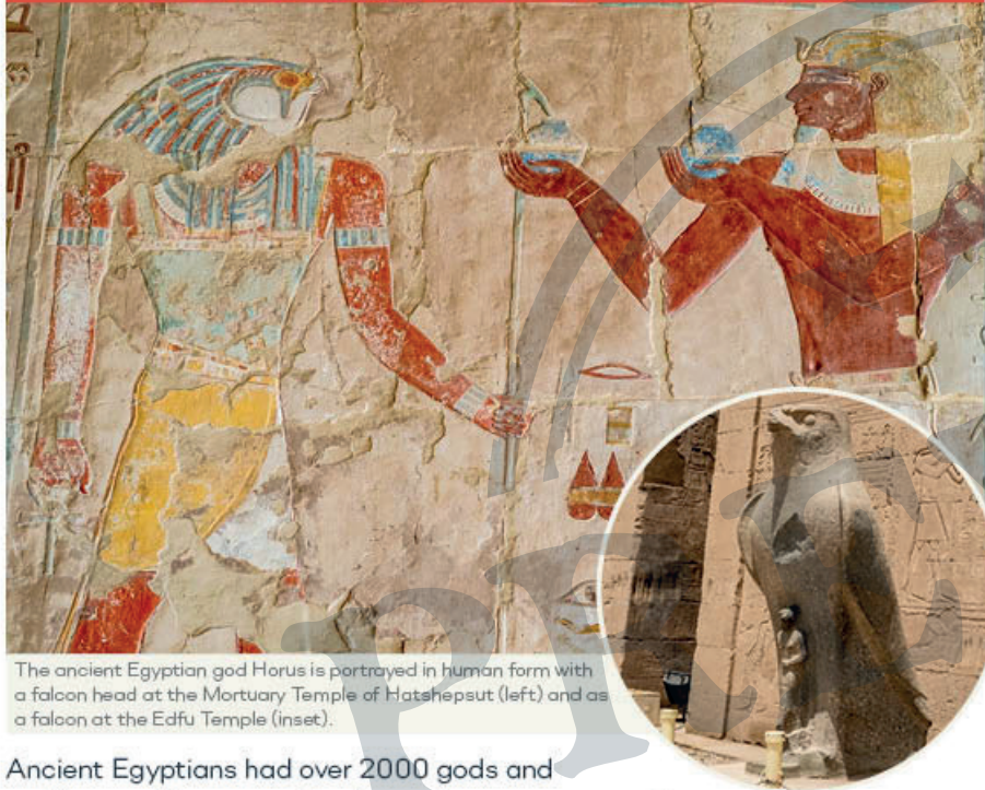
The ancient Egyptian god Horus is portrayed in human form with a falcon head at the Mortuary Temple of Hatshepsut (left) and as a falcon at the Edfu Temple (inset).

Ancient Egyptians had over 2000 gods and goddesses. Some were local to a city or an area and some were known across Egypt. Many gods and goddesses had the head of animal and body of human. Over time, ancient Egyptian gods changed roles and forms, sometimes even merging with other gods.